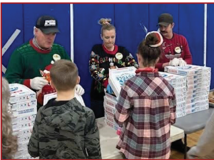
ENSTAR Southern Division volunteers served up 70 pizzas.

This past December, ENSTAR employees donated over 1,000 books to Willow Crest Elementary and Sterling Elementary Schools and celebrated with a Book Drive and Pizza Party at each location.