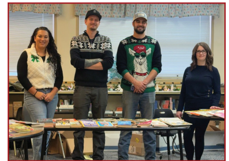
ENSTAR employees helped students choose from over 400 donated books at Sterling Elementary.

Students had the chance to choose a book to take home and then enjoyed a pizza lunch, served by ENSTAR volunteers.